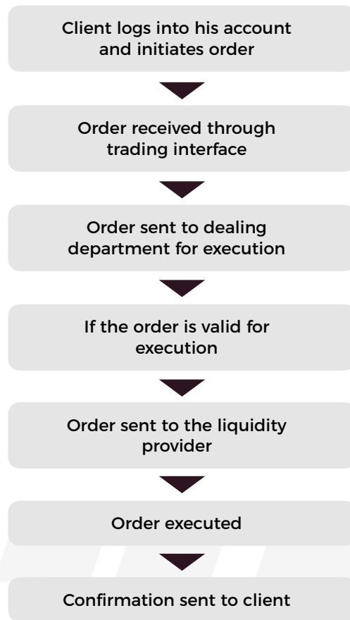
Diagram 2: Diagram showing Order Execution Flow Chart when the Company is dealing on own account